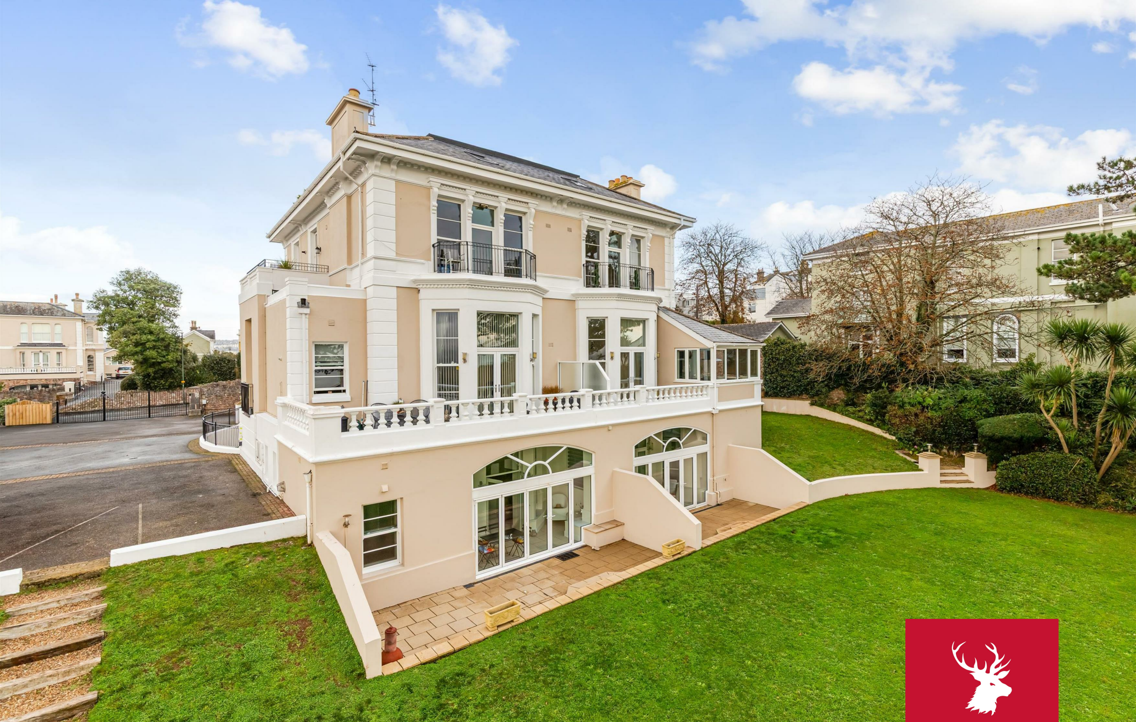
4 Villa Rosa